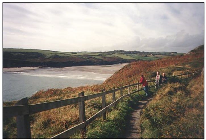
Cliff top walk above the Warren Strand, Rosscarbery

CHURCH SERVICES: All church services are catered for in Skibbereen, Church of Ireland, Christian Brethren, Methodist and Catholic. Bantry Christian Fellowship has been very welcoming to our visitors who have been made to feel really at home.