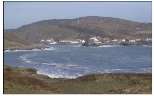
Tralispeen / Tragumna Bay

being situated in the Killarney National Park. Here a boat ride across the famous lakes or a trip in a jaunting cart can be enjoyed, A visit to the Kerry Bog Museum or the Working Farms Exhibit are both highly recommended. Here you will see rural life as it used to be lived and the attention to detail is remarkable. Actors in period dress are provided at the Working Farms Exhibit and we are certain that children will enjoy the farm animals.