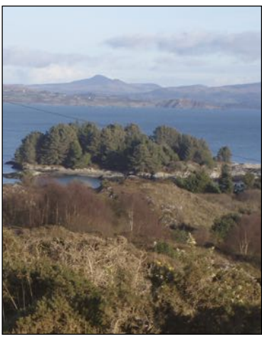
Coastal Drive above Zetland Pier

immediate region, details can be supplied on request or from the Tourist Office.