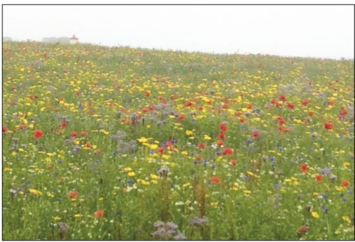
Colourful flower meadows on coastal walks around Tragumma Bay

CYCLING: This is a popular pastime for many visitors, as the pace of life is most suited to this pursuit. The owners of Edens Edge have prepared some suggested rides, which range from gentle outings to real adventures. Cycles can be hired locally with full details available on request.