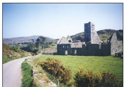
Walking on Sherkin Island