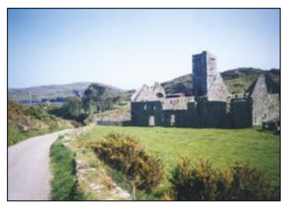
Walking on Sherkin Island