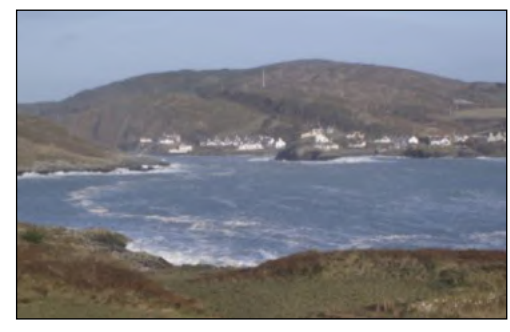
Tralispeen / Tragumna Bay

being situated in the Killarney National Park. Here a boat ride across the famous lakes or a trip in a jaunting cart can be enjoyed, A visit to the Kerry Bog Museum or the Working Farms Exhibit are both highly recommended. Here you will see rural life as it used to be lived and the attention to detail is remarkable. Actors in period dress are provided at the Working Farms Exhibit and we are certain that children will enjoy the farm animals.