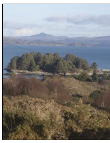
Coastal Drive above Zetland Pier

immediate region, details can be supplied on request or from the Tourist Office.