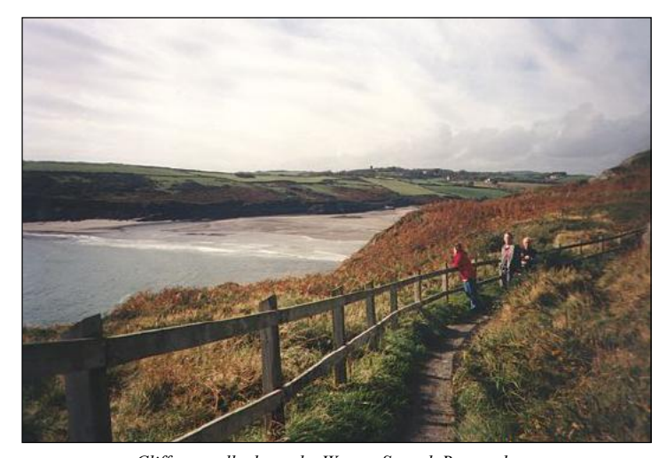
Cliff top walk above the Warren Strand, Rosscarbery

CHURCH SERVICES: All church services are catered for in Skibbereen, Church of Ireland, Christian Brethren, Methodist and Catholic. Bantry Christian Fellowship has been very welcoming to our visitors who have been made to feel really at home.